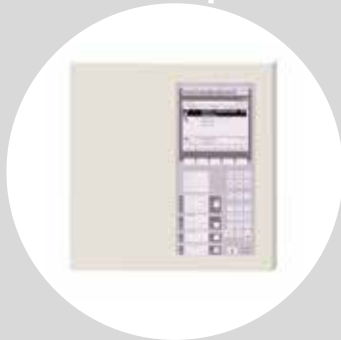
Fire alarm centre