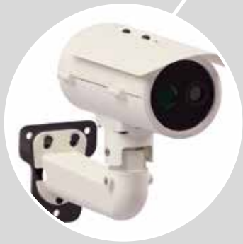
Fire Multi Detector